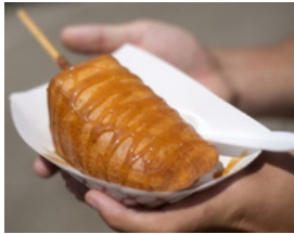
2024 WINNER DEEP-FRIED CHEESECAKE THE WAFFLE WAGON