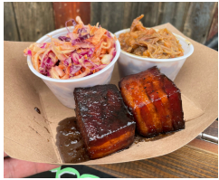
2023 WINNER MEAT CANDY WHISKY HOTEL BBQ